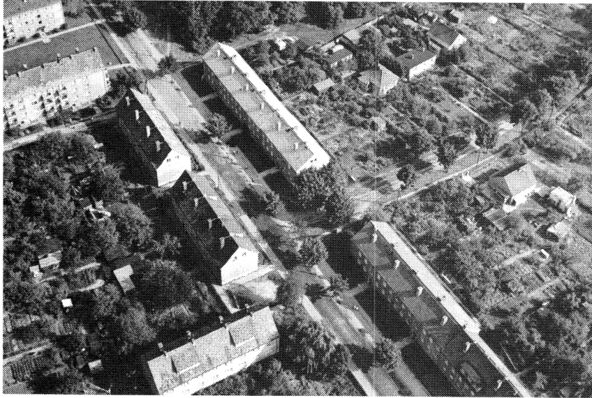
Bild 55 Luftbild